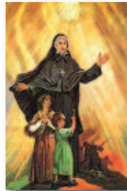
Saint Claudine Thévenet

The Jesus and Mary Educational Communities recognize that young people are the hope of tomorrow and a powerful force for renewal in the Church and in the world.